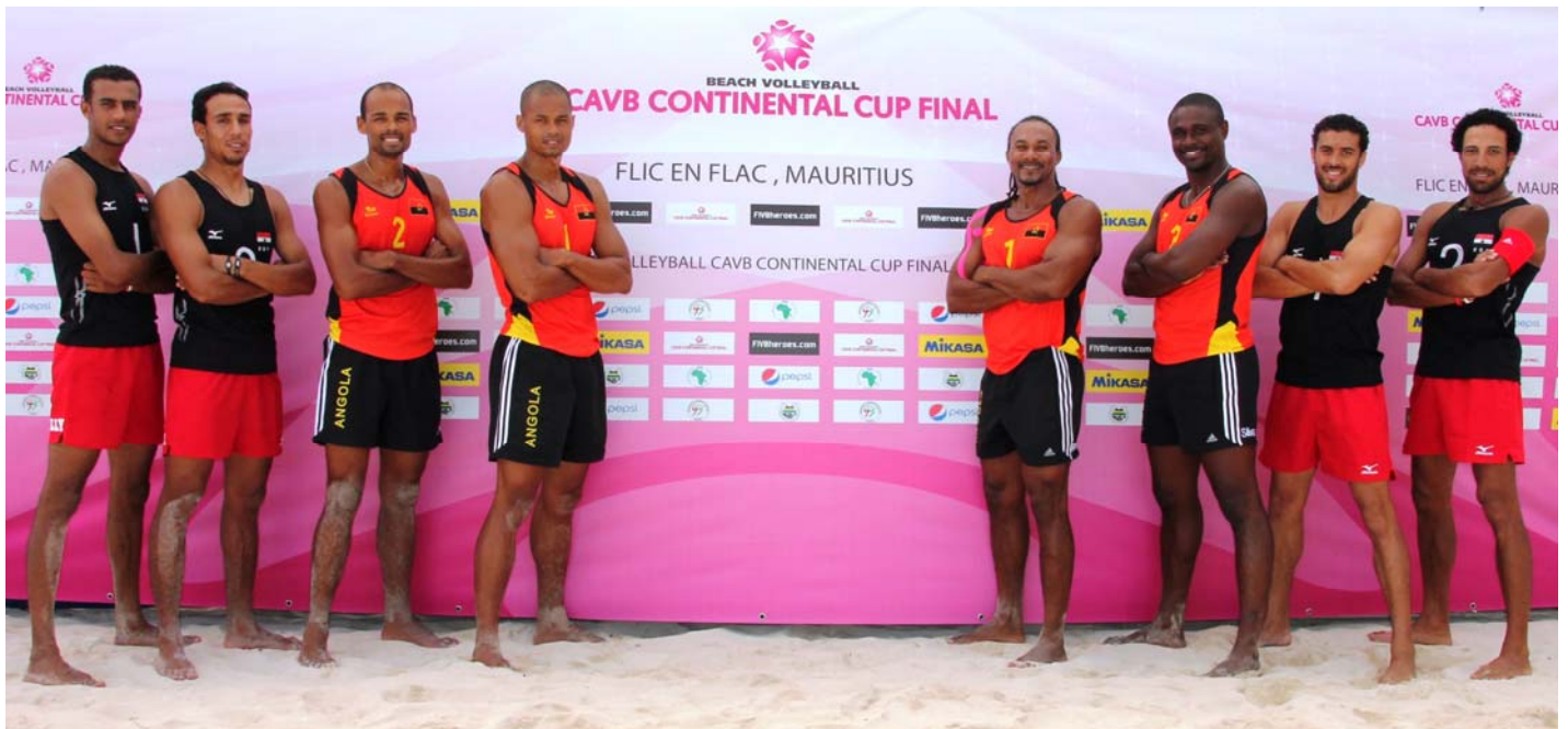
Teams of Angola and Egypt scheduled for day 1 of the competition