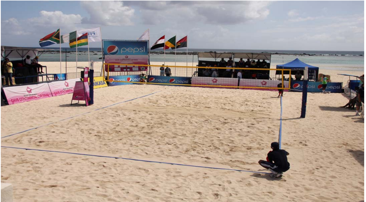
Centre court final preparation for day 1 of the CCUP FINAL