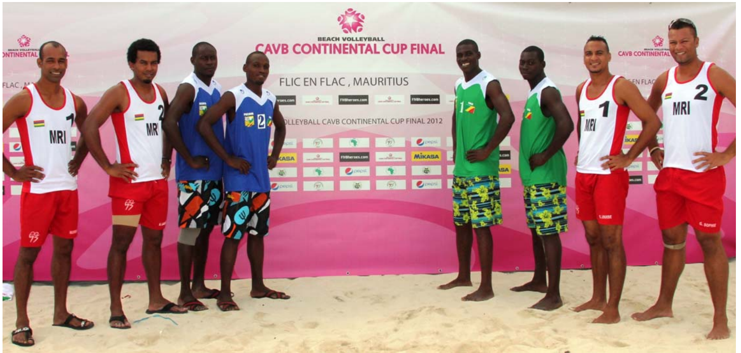
Teams of Mauritius and Congo Brazza playing the opening matches the CAVB CCUP FINAL